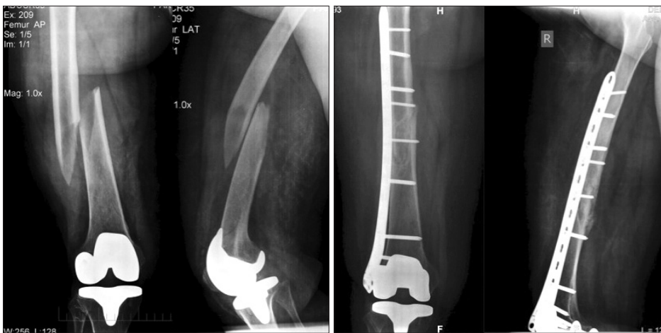
Fig. 1. A type II distal femur fracture treated by minimally invasive plate osteosynthesis (MIPO) using a 4.5 mm distal femur locked plate. Follow-up radiographs show union and satisfactory alignment.

TKA: total knee arthroplasty, ROM: range of motion, WOMAC: Western Ontario and McMaster Universities Arthritis Index, MUA: manipulation under anesthesia.